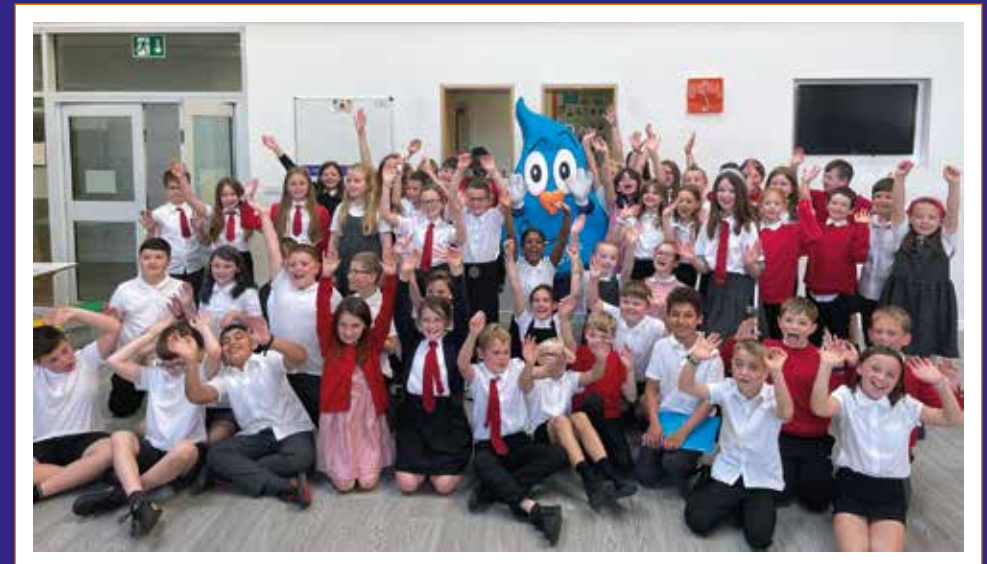
Primary 6 classes at Heathfield Primary