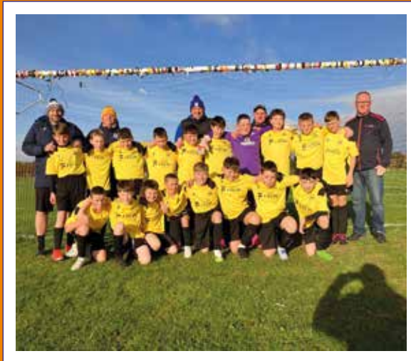
Kilwinning Academy Youth 2011 Team