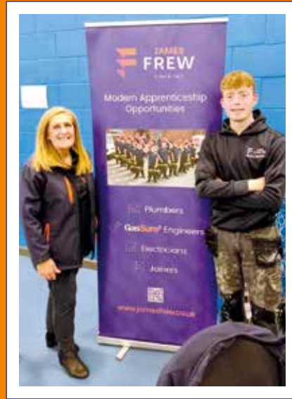
Greenwood Academy Apprenticeship Event

Our James Frew Academy team were on hand to outline the benefits of the Modern Apprenticeship scheme and of course, the value of a career at James Frew.