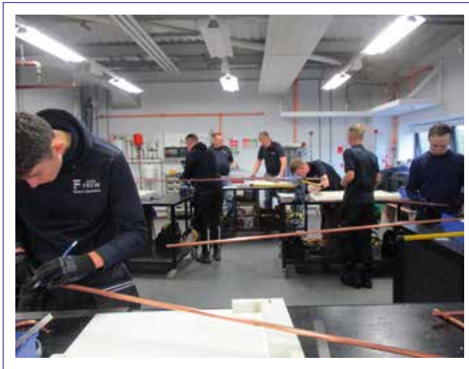
Pipe Bending Training

The Annual James Frew Beat the Boss competition was held in October. This year was also our first Carpentry and Joinery Beat the Boss.