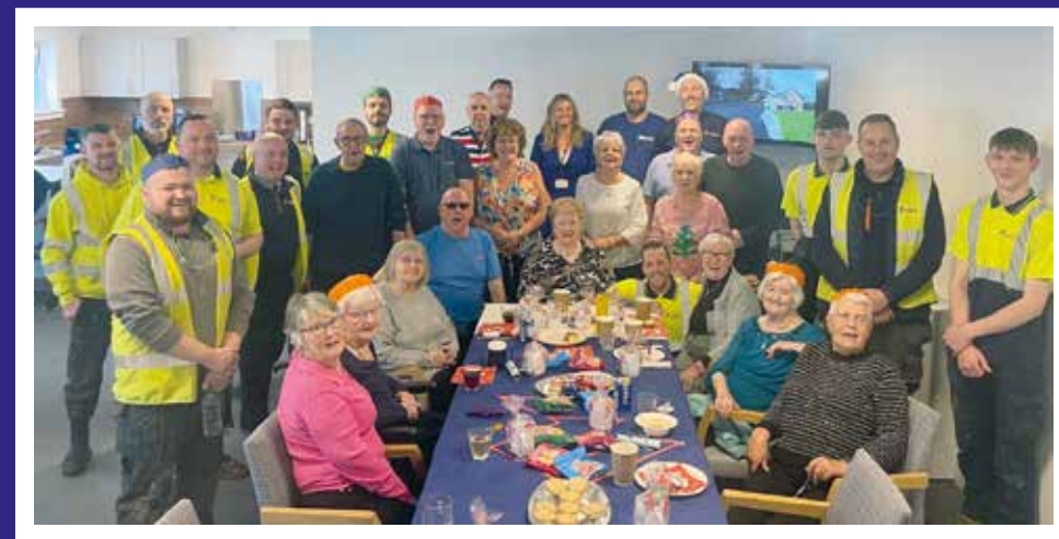
The residents of Barnett Court

The residents of Barnett Court sheltered housing complex enjoyed an afternoon of festive fun on the 20th of December, a lovely Christmas lunch was organised by the James Frew Management team as an appreciation for their patience and consideration during the renovation period at the complex.