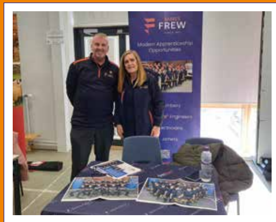
Auchenharvie Academy Careers Event